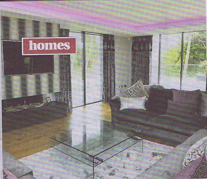
STATEMENT: This 8,700 sq ft house replaced a dated dormer bungalow. Above, sitting room with Dru fireplace and lighting system designed by Triangle and supplied by DuLuce. Below, pool with pink aluminium wave sculpture.